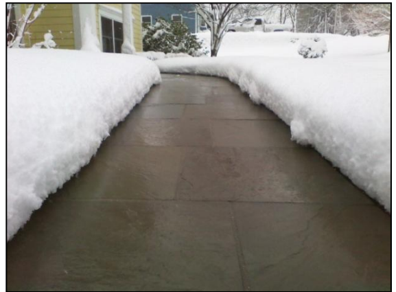
Radiant heated walkway with stone pavers.